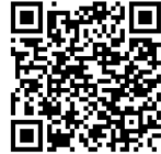
St. John's Ministries 2024

Did you miss the Ministry Fair on Sept. 8 but are still interested in serving? It's not too late! There are many wonderful opportunities at St. John's where you can use your own unique talents and gifts. Scan this QR code to see all the ways you can get involved.